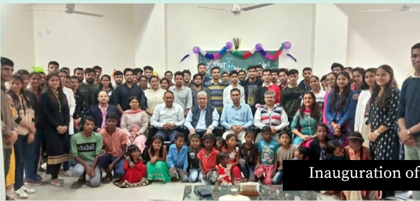
Inauguration of CES, October 2019