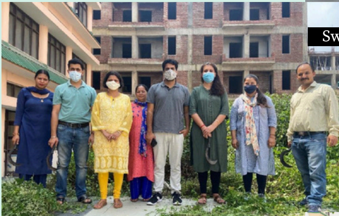
Swacchta Abhiyan, Aug 2021