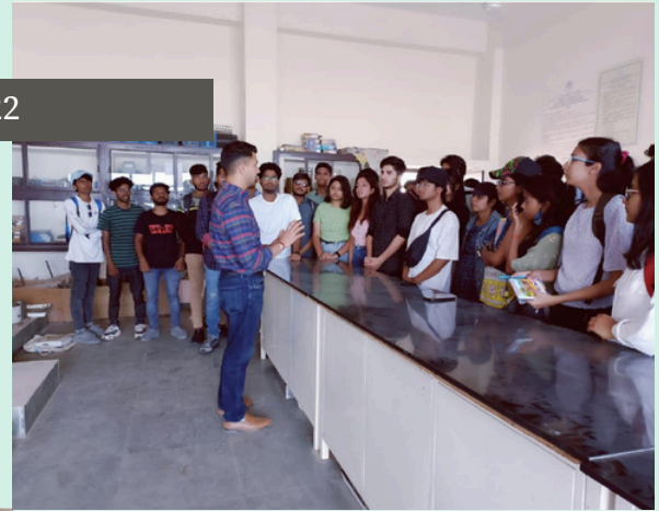
Visit by MNIT Jaipur students on 13/4/2022