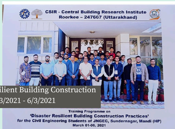
Training Programme on Disaster Resilient Building Construction Practices held at CBRI Roorkee on 4/3/2021 - 6/3/2021