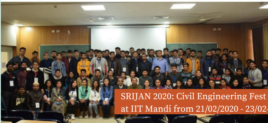
SRIJAN 2020: Civil Engineering Fest held by Nirmaan Club at IIT Mandi from 21/02/2020 - 23/02-2020