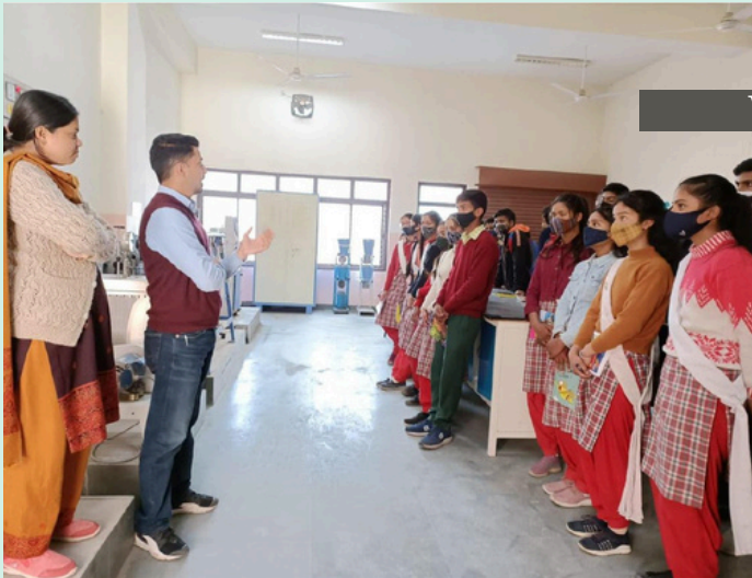
Visit of school students to labs