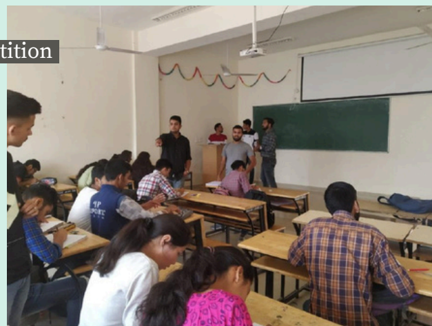
Logo making and Essay writing competition