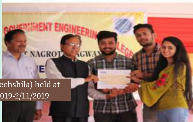
Technical Exhibition at Techfest (Techshila) held at RGGEC Nagrota Bagwan on 1/11/2019-2/11/2019